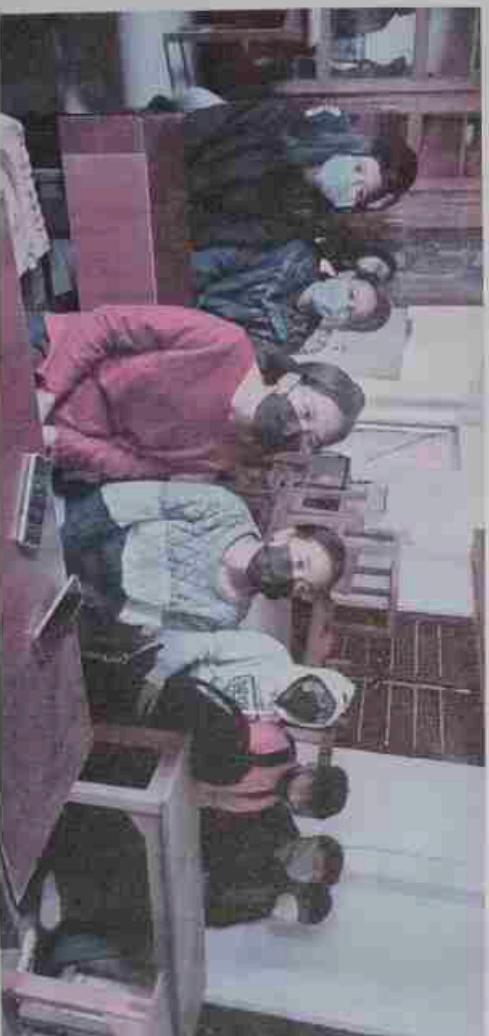
STUDENTS LISTENING TO THE PRINCIPAL'S TALK