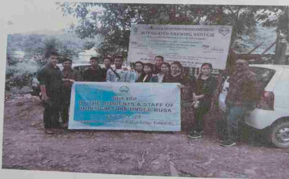
AT THE GATE OF THE BANANA PLANTATION FIELD