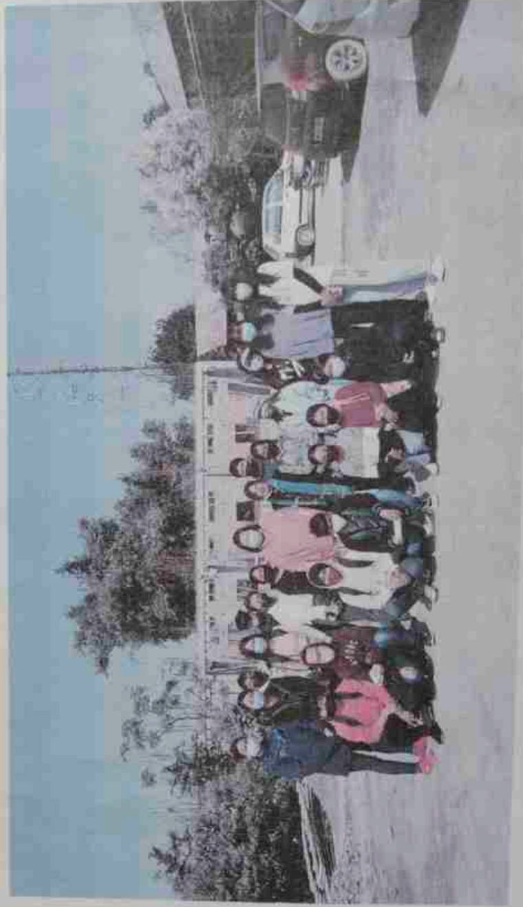
PHOTO SESSION OF THE STUDENTS WITH THE PRINCIPAL AND NODAL OFFICER