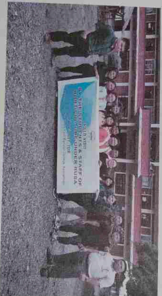
AT THE COLLEGE CAMPUS