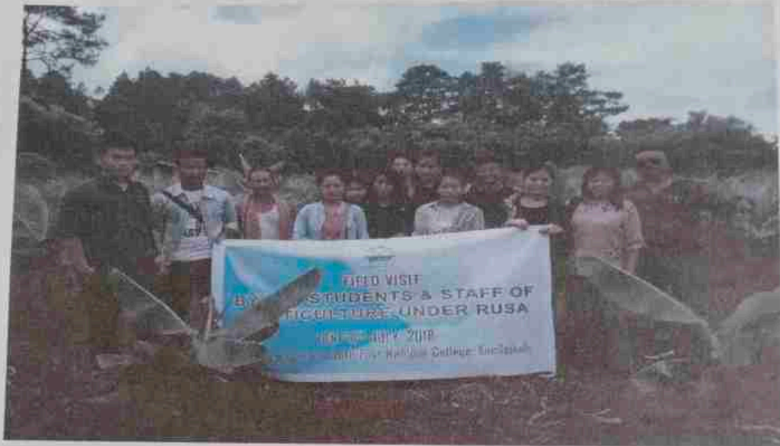
AT THE SPOT