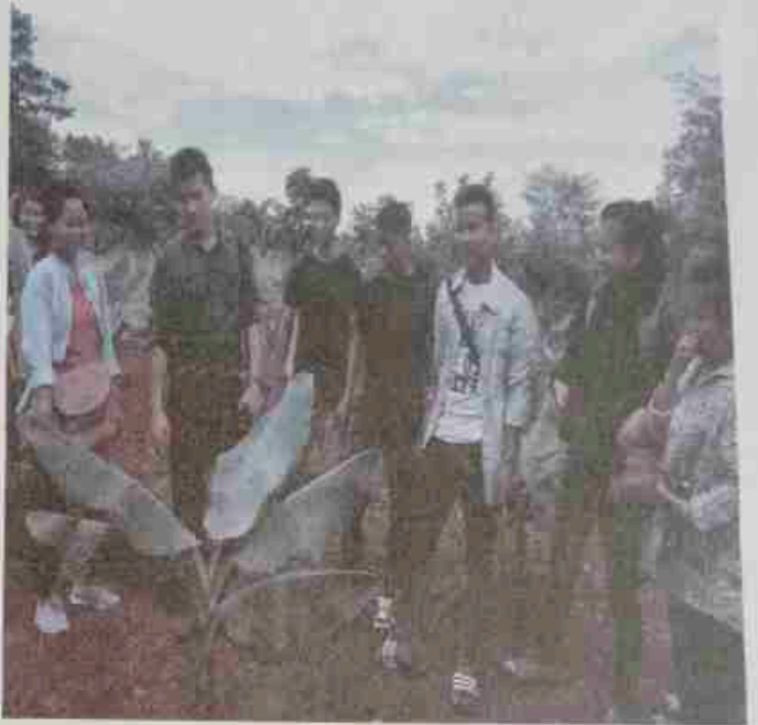
TEACHER SHOWING THEM THE BANANA PLANT AND HOW TO CULTIVATE THEM