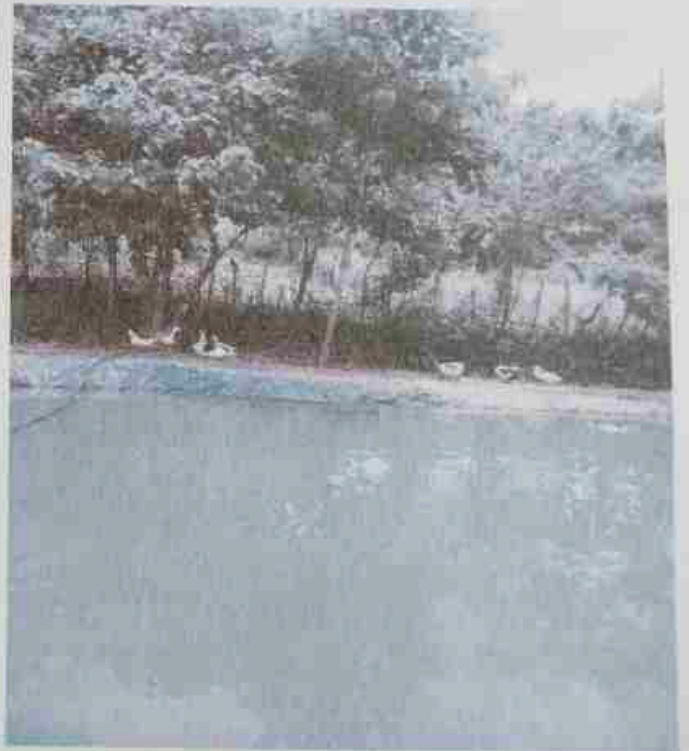
KING CHILLY AND POND WITH DUCKS