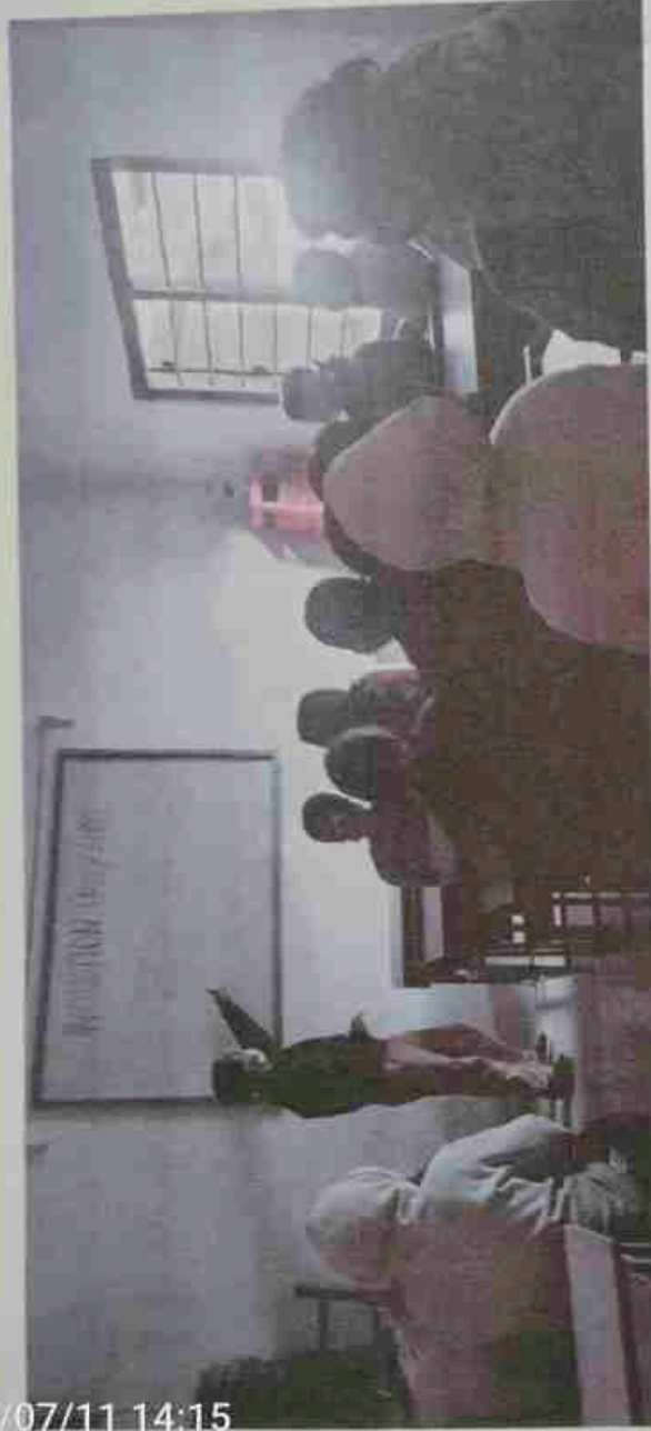
TALK BY THE CONCERNED TEACHER