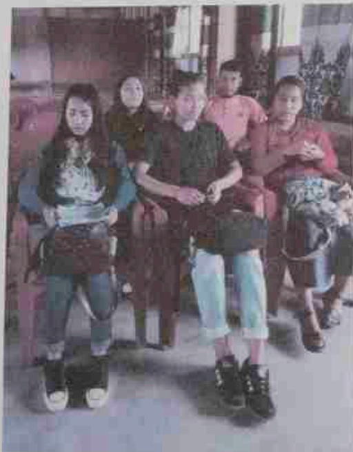
Students (Half Row)