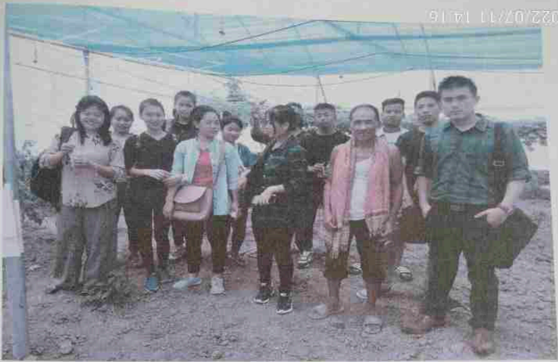
IN THE FIELD SPOT