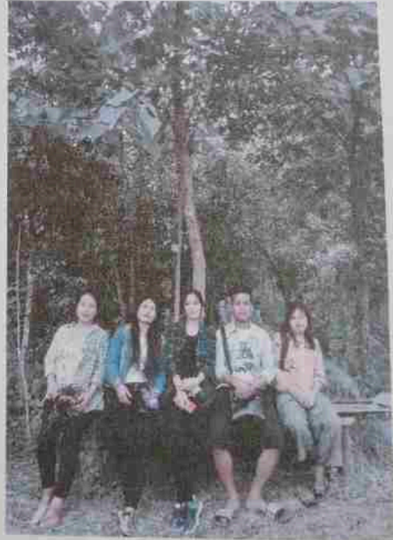
TEACHERS AND STUDENTS